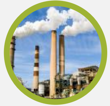
POWER & ENERGY